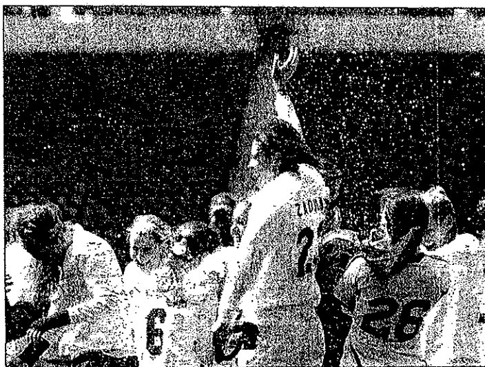
The Loyola girls soccer team was one of the many teams and athletes in celebration mode in 2012.

The spring season was filled with action with the New Trier and Loyola softball teams piling up wins