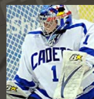
St. Thomas Academy