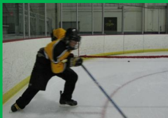
Over speed Training