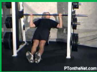
Sport Strength Training