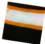
Sock's & Jersey's

Place your order at goalie30hockey@gmail.com