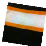
Sock's & Jersey's

Place your order at store@jaguarhockeyclub.com