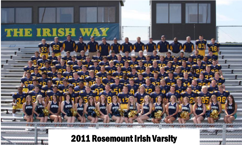
2011 Rosemount Irish Varsity