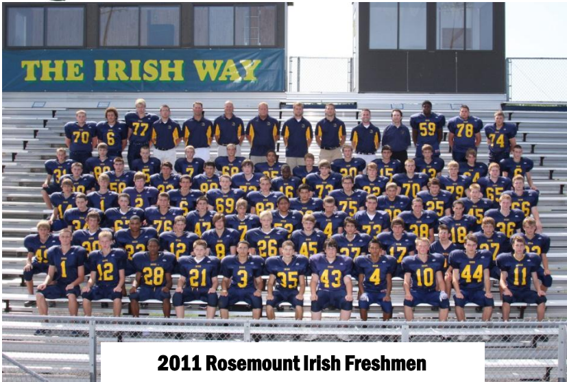
2011 Rosemount Irish Freshmen