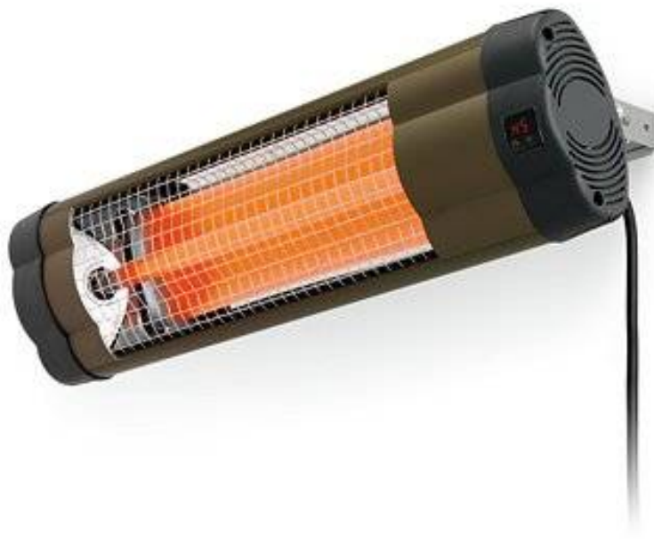
HTR7 - Mid-Wave Infrared Heater - can be mounted via a bracket inside any quick set-up canopy or on a 72-inch individual stand