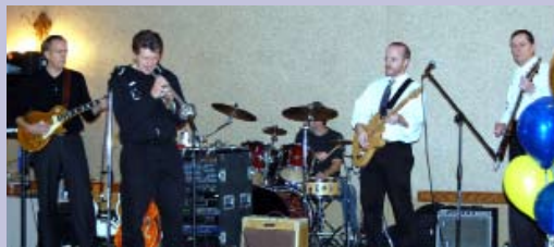
Band: R.I.D.E. Time: A.W.E.S.O.M.E.