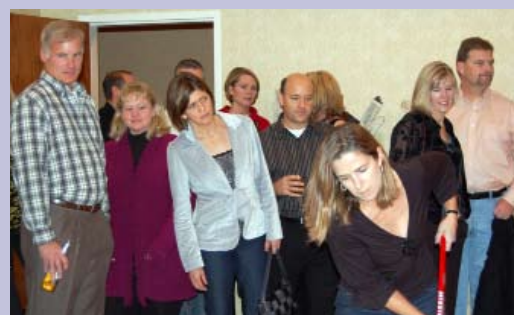
Evening Social guests wait for their turn to go for Top Shot.

The Evening Social is the one fundraiser WYHA conducts during the year. This year, the Evening Social took place on Friday, November 14, 2008 and was held at the Sheraton West in Minnetonka. The evening started with a welcome