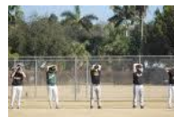
Elbow to sky