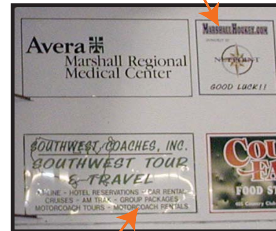
4' x 8' Arena Billboard