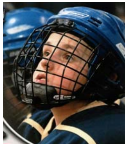
Over 150 Hockey Players On (11) teams Playing & Practicing Each Week

Our members are volunteers and participants in our program. This structure is very unique in that the association is the owner and manager of its own facility. While this creates unique challenges and demands on the volunteers, there are many advantages. The association can establish programs and schedules without a landlord creating restrictions. The association can plan for the future. Equity in the facility will continue to grow that can be used to fund future expansion. The continued success of the Sheboygan Laker Ice Center will be determined by the dedication of its volunteers to maintain and improve the facility. A foundation was established in 2001 to ensure that fund raising activities for capital improvements would be separate from the regular operations of the Association. This foundation (Sheboygan Blue Line Charitable Foundation, Inc. 501©, (3) public charity) will continue to assist in the long-term efforts of the success in providing a professional and quality ice rink for the community of Sheboygan.