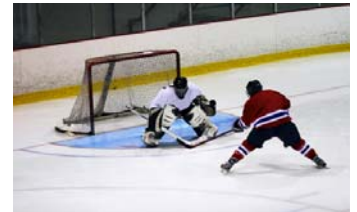
Tournaments Bring in 1,008 families to Sheboygan for (3) days