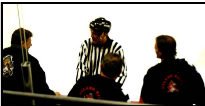
YEAR IN PHOTOS 1989