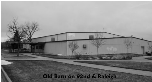
Old Barn on 92nd & Raleigh

There are way too many people who made Hyland strong and continue to make Hyland strong. There are so many different board members, hockey directors, assistant directors, coaches, team managers, members, players, rink managers and bar tenders to even think about starting to mention names. What makes a team strong hockey team on the ice also makes a team strong support team off the ice and we had some very good teams then and now.