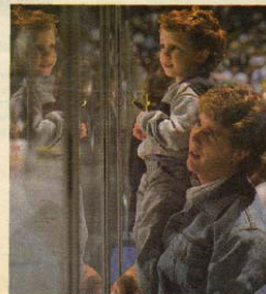
The anticipation was great on opening night, Oct. 6, as the Fabulous Forum as the fans awaited the debut of Wayne Gretzky in a Kings' uniform. No. 99 didn't disappoint, scoring one goal and three assists in L.A.'s 8-2 win over the Detroit Red Wings.