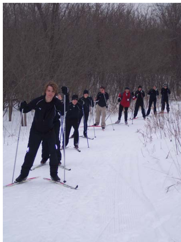
Figure 3 Rochester Nordic Ski Team Members, February 2008

Finally, all of the trail groomers and RASC members associated with the trail construction routinely get many words of thanks and appreciation from skiers. In addition to local skiers, the number of visitors from Iowa, and surrounding cities such as Austin, Winona, and Minneapolis/St. Paul has been surprising as well. Now that the trail is 10 km long, it is beginning to draw guest skiers looking for variety in their training routine.