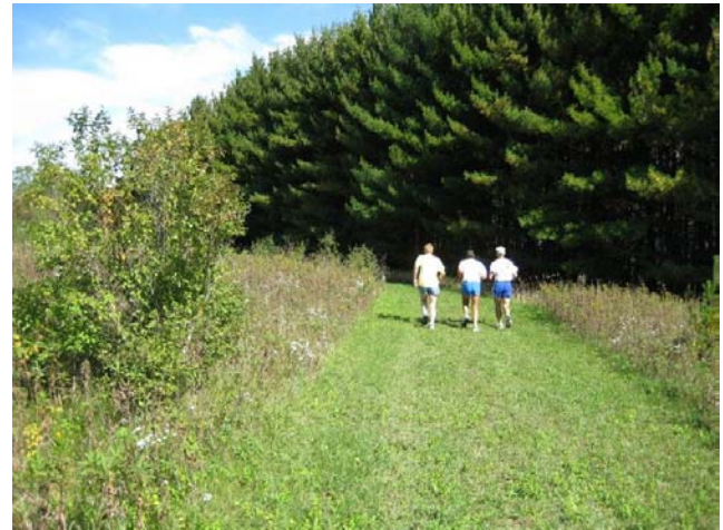
Figure 1 Trail runners on the east trails, summer 2007

It's also interesting to note these runners taking advantage of the unique width of the trails that allows them to run abreast of one another and enjoy the social aspect of a group outing. High School Cross Country teams have also inquired about running on the trails as part of their practice and we expect they have put them to similar use.