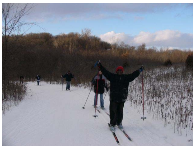
Figure 2: Middle school skiers ascending the hill heading east toward the Payne sheds.

Another group that uses the trails extensively is the Rochester Nordic Ski Team for Middle and High School students. This program continues to grow serving 99 students this past ski season. The Quarry Hill trails provide a great practice site for them with challenging terrain and shelter from the wind. This is especially important on cold days when wind chills on an open golf course or field would result in conditions too cold to ski in.